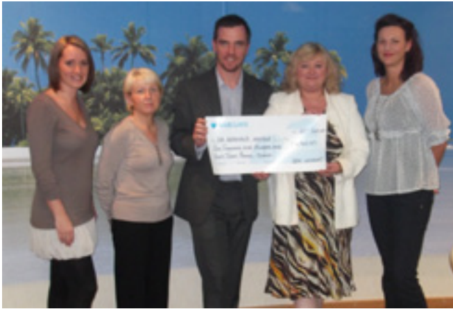
The Social & Charities committee presenting Dr Kershaw's Hospice with their fundraising cheque